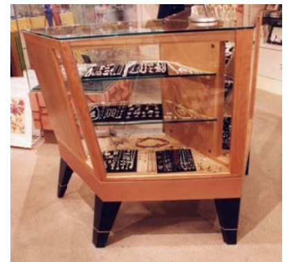
Display cabinets; mid-nineties; (above) ash and figured sapele, (below) cherry - solid and veneers, copper, aluminum; designed by Chachkas