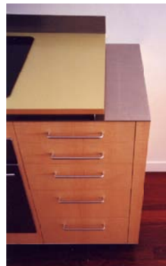
Kitchen; late nineties; curly ash veneers, stainless steel; designed by Javier Campos