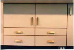
Kitchen; early nineties; plastic laminate on oak edged substrate, oak plywood, (I built all the windows and doors for this project as well); designed by N. Scott