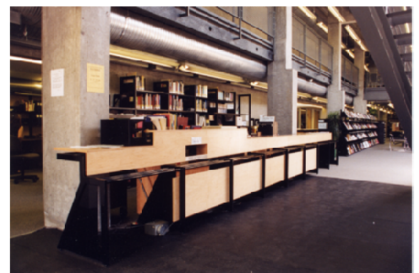
Library check out counter; mid-nineties; birch ply, steel, Marmoleum; designed by Patkau Architects