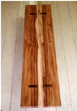
Low bench; early eighties; satin walnut; designed by N. Scott