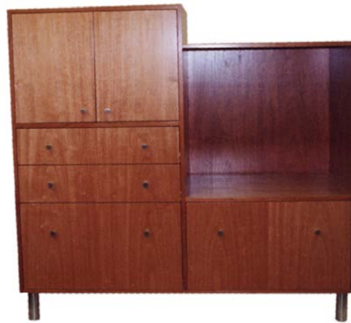
A/v cabinet, late nineties, honduras mahogany, designed by N. Scott